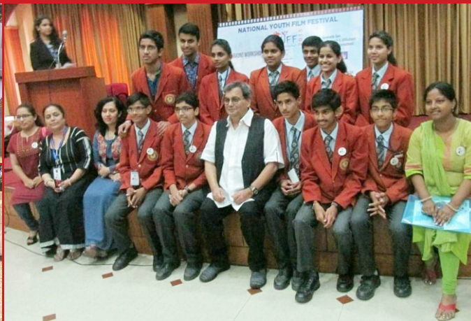
Gold Winning students of Red Rose School, Lambakheda, Bhopal with noted film maker Mr. Subhash Ghai at the National Youth Film Festival in Goa.