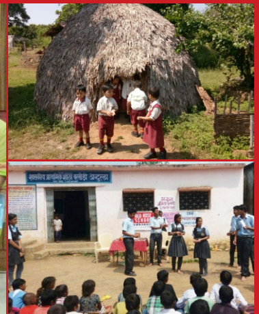
Visits to historical places and community services are a regular part of our curriculum.