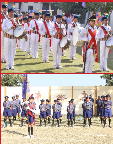
Scouting brings in discipline. Band brings in coordination.

•Theatrics •Music •Painting •Yoga •Craft Creations •Taekwondo •Art Design •Film Making •Scouts and Guides •Band •Dance-Indian and Western •Orchestra